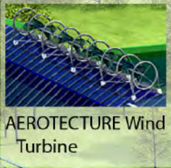
AEROTECHTURE Wind Turbine