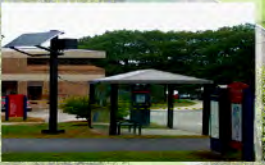
Solar Lighted Bus Shelter