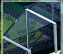
Solar Integrated Glass