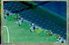
SopraNature Living Vegetated Green Roof